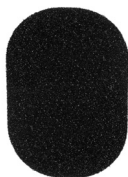
WS2 Windshield (optional)