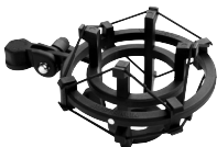
SM2 Shock Mount (optional)